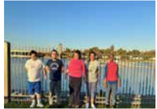
Walk Fit, Fall 2025