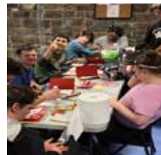
Art & Design, Winter 2025