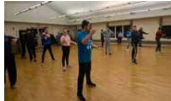
Zumba, Winter 2025