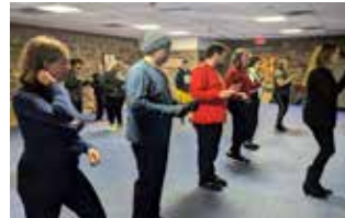
SEC Dance Company, Winter 2025