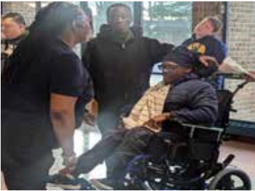
Play Production, Winter 2025