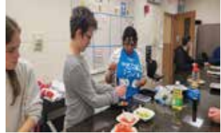
Teen Chefs, Winter 2025

Spring SEASON 4/8 - 6/10 (8 Weeks) NO PROGRAM: 4/15, 5/27 CODE: CHEFS S110 DIRECT COST: $300.00 OPWDD/Waiver Confirmed: $96.00 TRANSITIONAL: $240.00