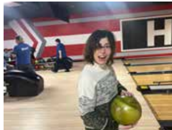
Bowling, Winter 2025

NOTE: Transportation is only available for those who live at home in the consortium area.