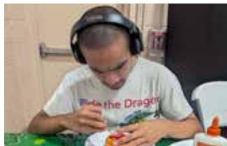
Friday Fun, Winter 2025

SPRING SEASON (3 weeks) PROGRAM DATES: 5/2, 5/16, 6/13 CODE: FRFUN S110 DIRECT COST: $269.00 OPWDD/Waiver Confirmed: $60.00 TRANSITIONAL: $132.00