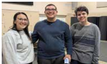
Friday Fun, Winter 2025