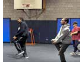
Partners In Sports, Winter 2025

Spring SEASON 4/8 - 6/10 (8 Weeks) NO PROGRAM: 4/15, 5/27 CODE: OLYM S110 DIRECT COST: $187.00 OPWDD/Waiver Confirmed: $72.00 Group Home/TRANSITIONAL: $104.00