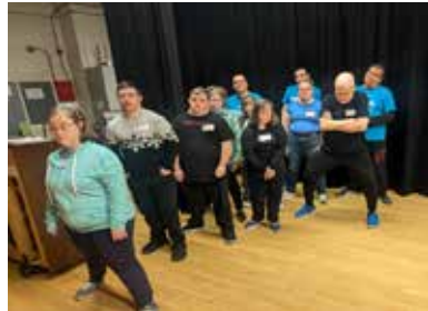
Play Production, Winter 2025