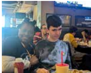
Lunch & A Movie, Winter 2025