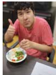
Mix it Up, Winter 2025